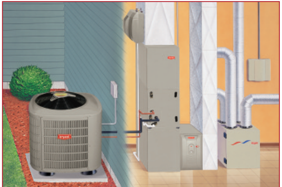
Heat Pump and Fan Coil System